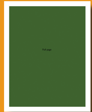
full page no bleed

phone 352-378-8823 ■ 1-877-HIKE-FLA fax 352-378-4550 email publications@floridatrail.org